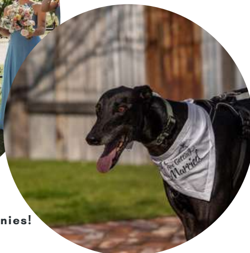
Dogs are welcome for ceremonies!