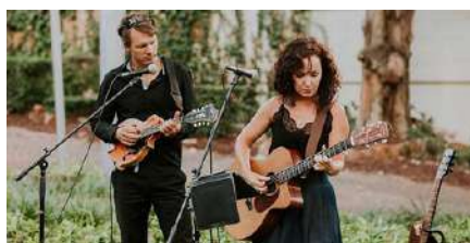
Fiona Rea Music Live Music & Reception Packages www.fionareamusic.com