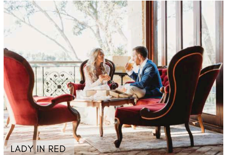
LADY IN RED