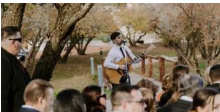
Wedding Music Perth Live music/DJ/MC packages www.weddingmusicperth.net