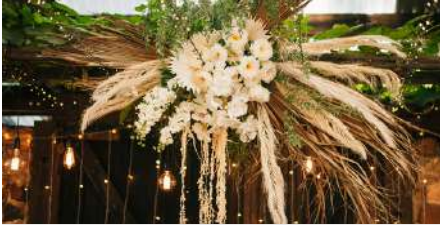
Affair with Flair Florist, Decorator & Stylist www.affairwithflair.com.au