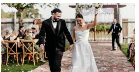
Jack In The Box Photographer jackintheboxphotography@outlook.com