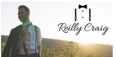
Reilly Craig Live Music & DJ www.reillycraigmusiclive.com