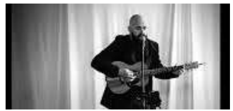
Jamie Hall Live Music www.jamiehallmusic.com