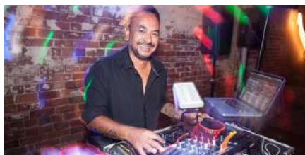
Off The Wall Promotions Entertainment Specialist www.offthewallpromotions.com.au