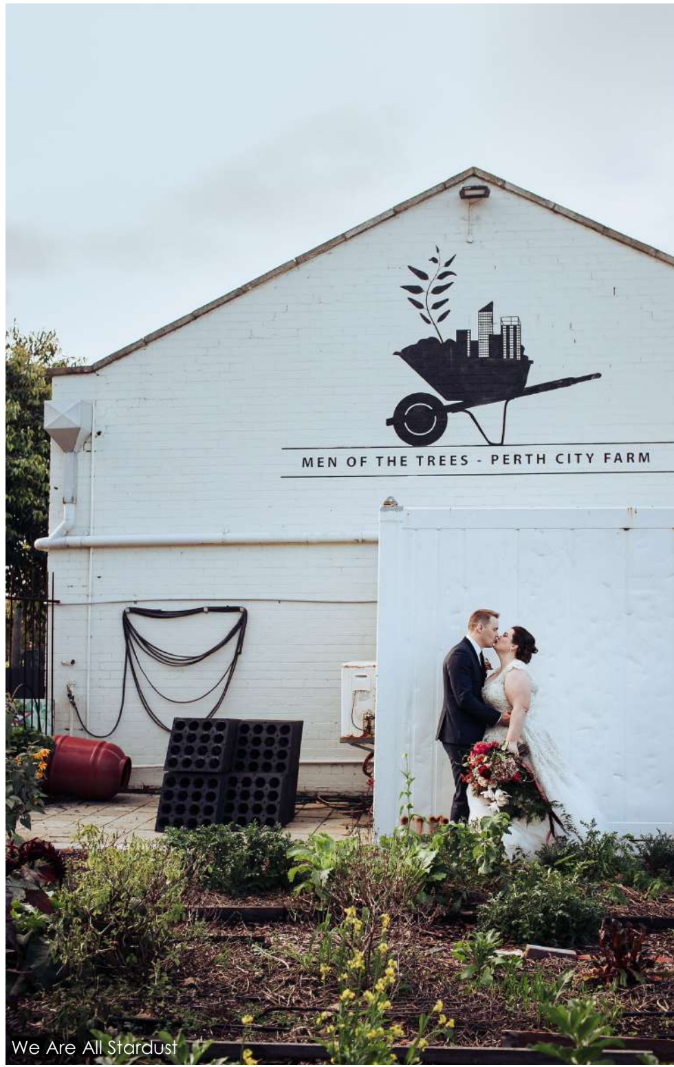
We Are All Stardust