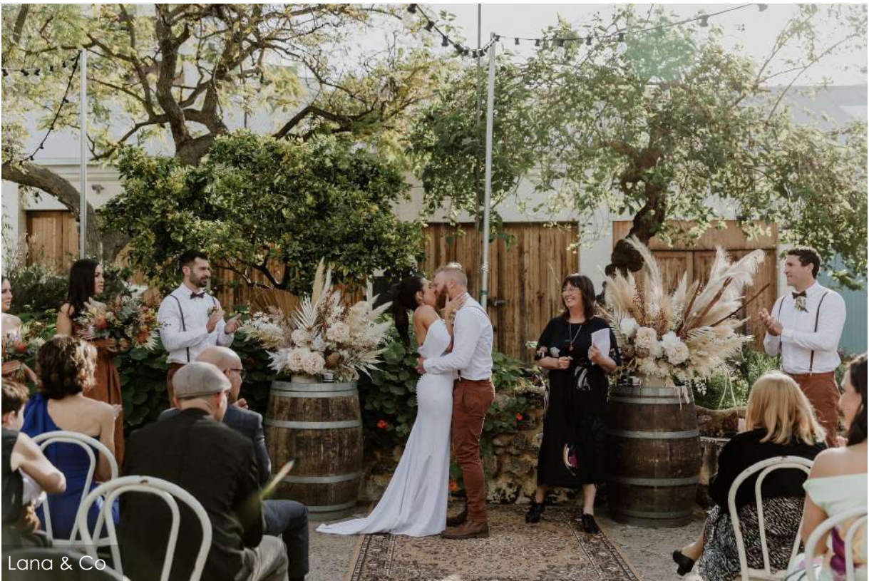
Lana & Co