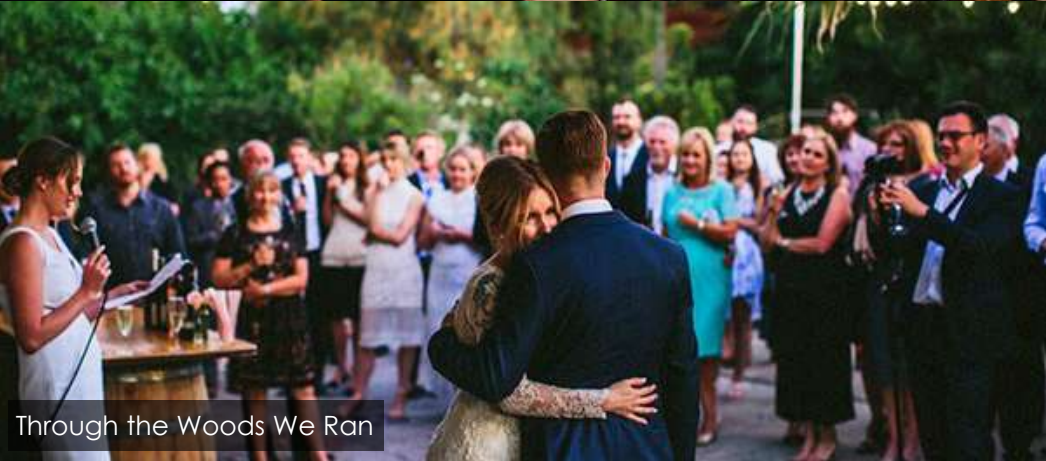
Through the Woods We Ran