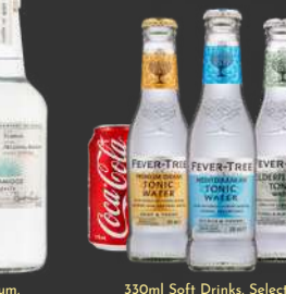
330ml Soft Drinks, Selection of Fevertree Tonic Water

oose Vodka, Sipsmith Dry London Gin, Kraken Black Spiced Rum Woodford Reserve Bourbon, Casamigos Tequila Blanco Gray Go