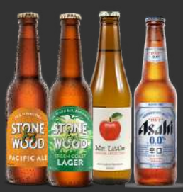
Stone & Wood Pacific Ale, Stone & Wood Lager, Mr Little Cider Asahi 0%