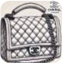
--PERFUME NAME-- Body copy