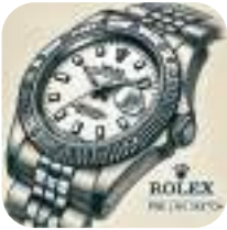
ROLEX Body copy