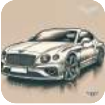
BENTLEY Body copy