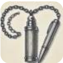
--PERFUME NAME-- Body copy