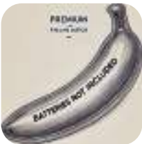
--PERFUME NAME-- Body copy