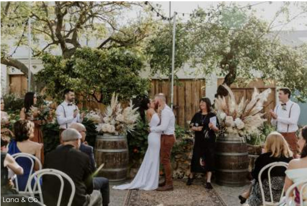
Lana & Co