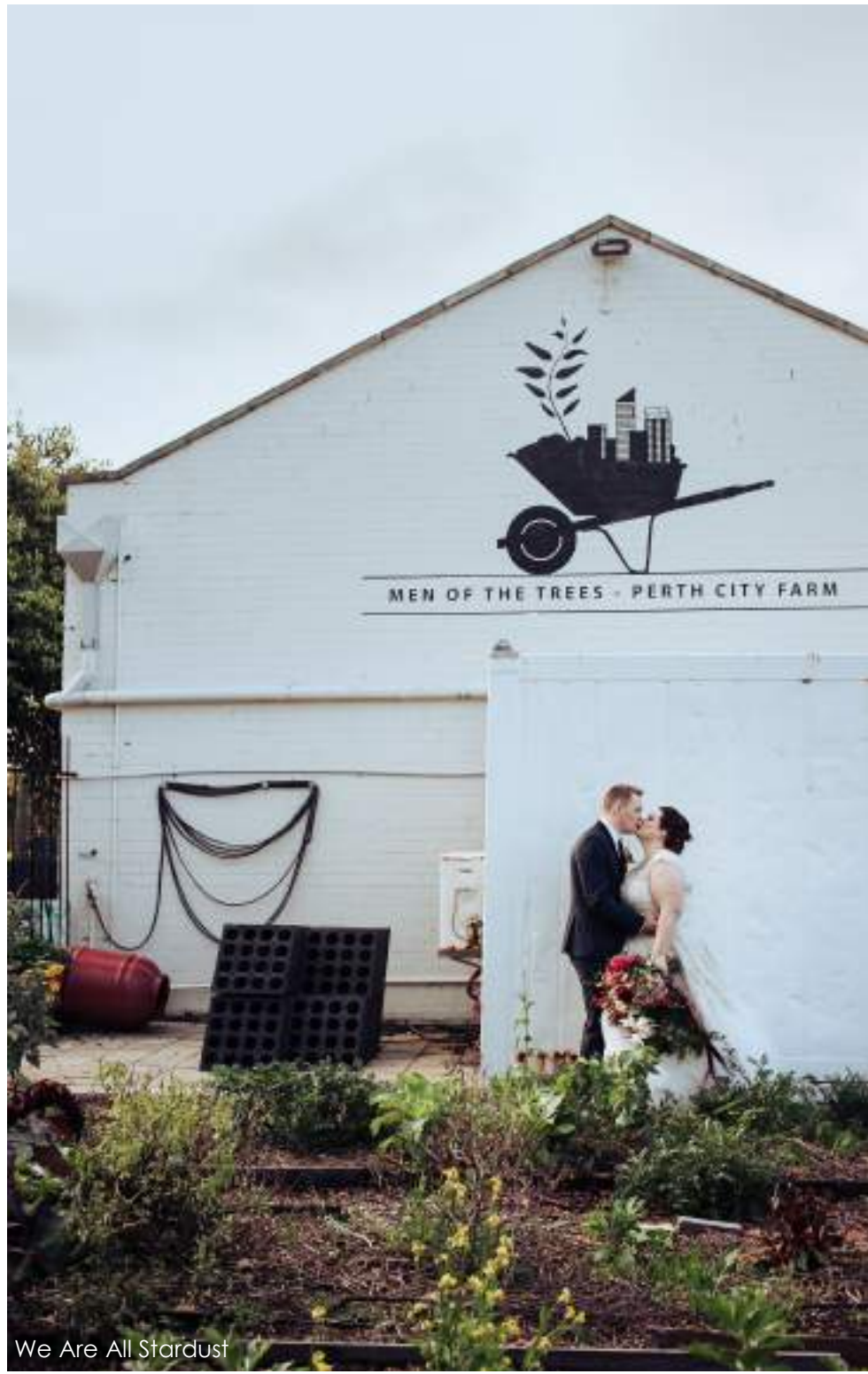
We Are All Stardust