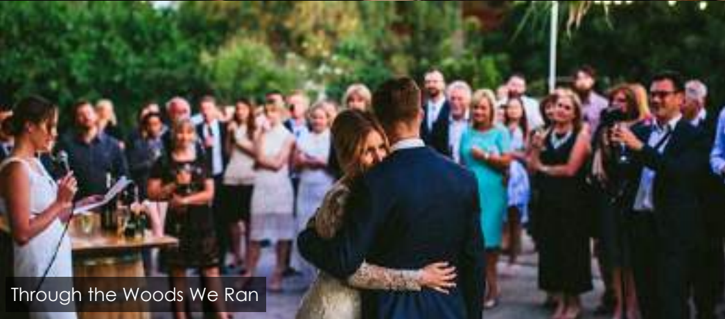
Through the Woods We Ran