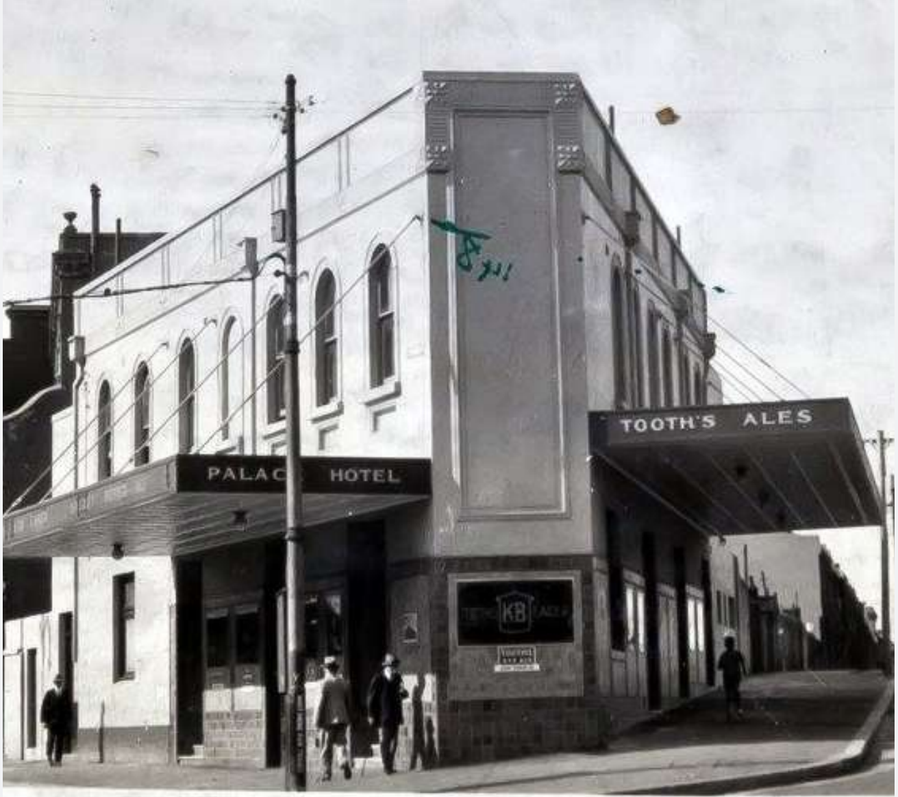
Palace Hotel, Darlinghurst 1930.