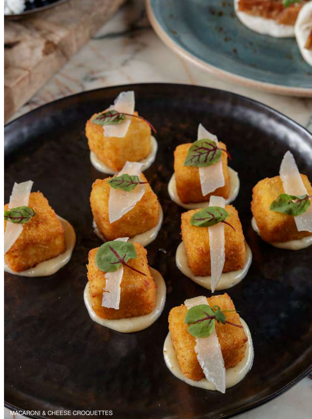
MACARONI & CHEESE CROQUETTES