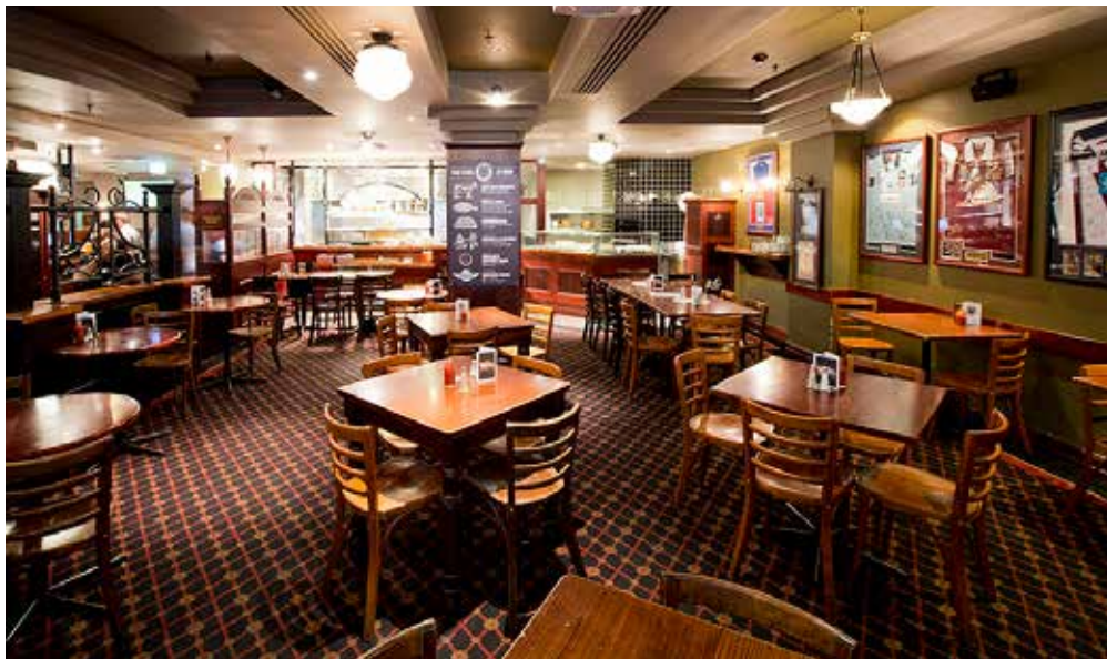
RESTAURANT AREA 70 SEATED / 120 STANDING