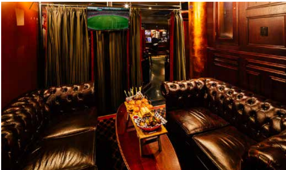
CHESTER ROOM UP TO 6 SEATED