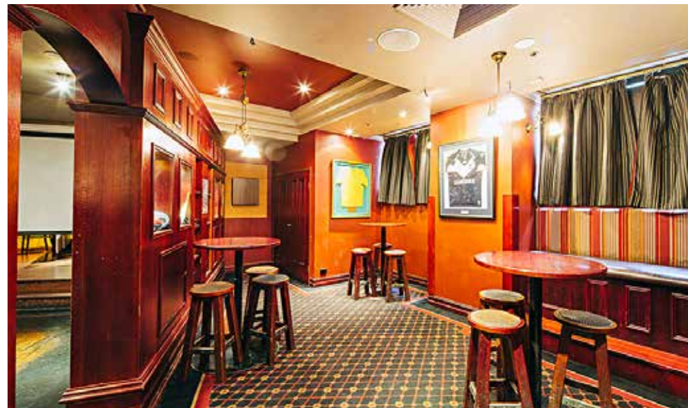
BOOKIES ROOM 20 SEATED / 30 STANDING