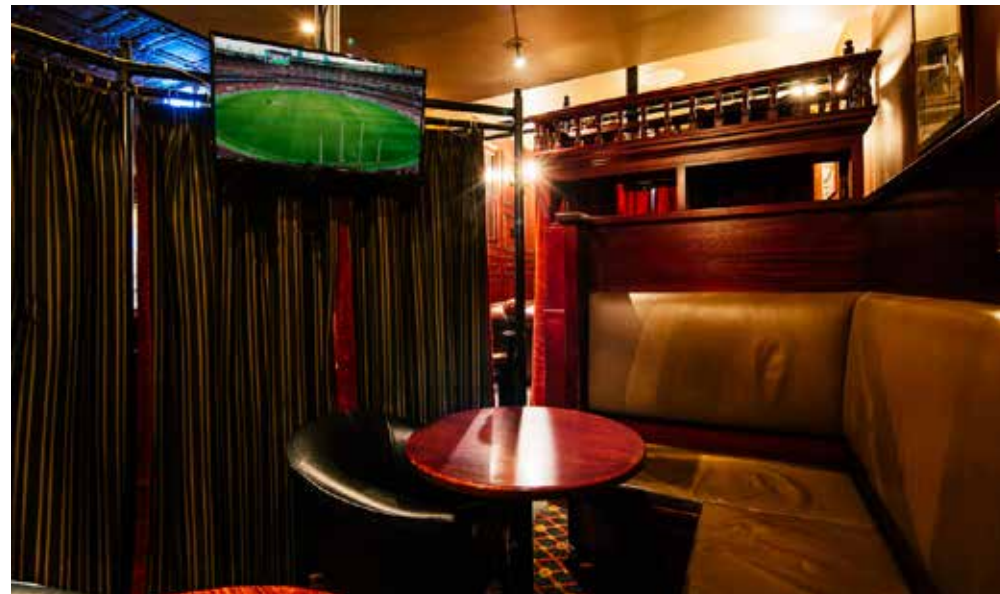
WHITE ROOM UP TO 8 SEATED