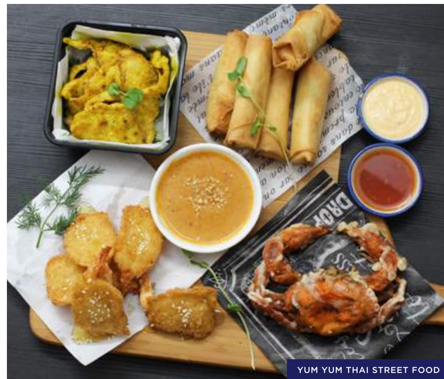
YUM YUM THAI STREET FOOD