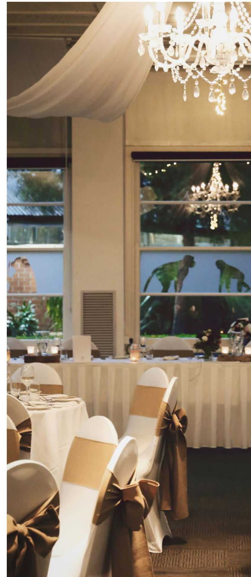
FIG TREE FUNCTION CENTRE

Enjoy any occasion in this highly versatile indoor venue. Fig Tree Function Centre is the perfect venue for corporate dinners, cocktail parties, conferences and special events. Central within the grounds of the Adelaide Zoo, your guests can explore the zoo during your event and conference breaks. All of your audio and visual requirements can be catered for, just ask our Event Manager!