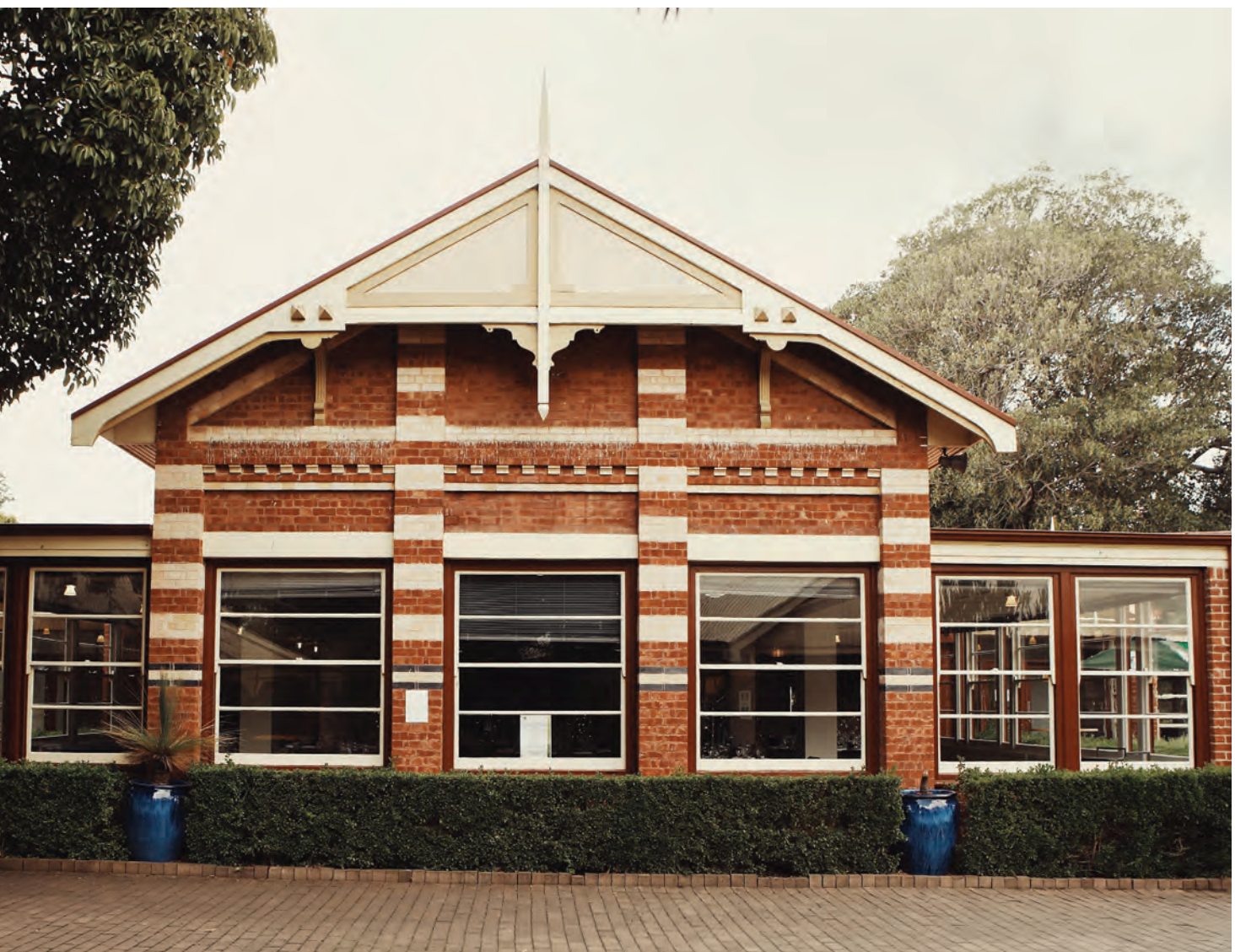
FIG TREE FUNCTION CENTRE

Enjoy any occasion in this highly versatile indoor venue. Fig Tree Function Centre is the perfect venue for corporate dinners, cocktail parties, conferences and special events. Central within the grounds of the Adelaide Zoo, your guests can explore the zoo during your event and conference breaks. All of your audio and visual requirements can be catered for, just ask our Event Manager!