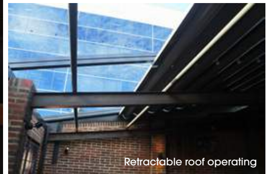
Retractable roof operating