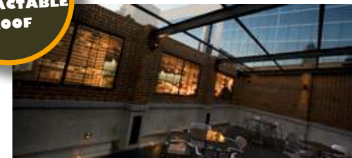
Rooftop Terrace Bar 360° view: http://www.function360.com.au/universal-bar/2/2.php

Please note that Rooftop Terrace Bar Bookings are not confirmed until receipt of $400 deposit. Any cancellations or date changes must occur before 8 weeks from booked date otherwise deposit is non-refundable.