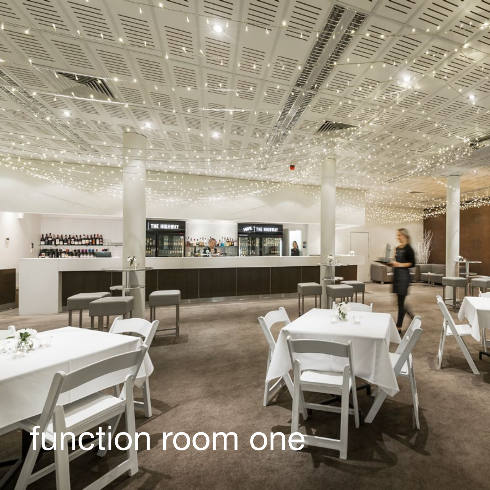
function room one