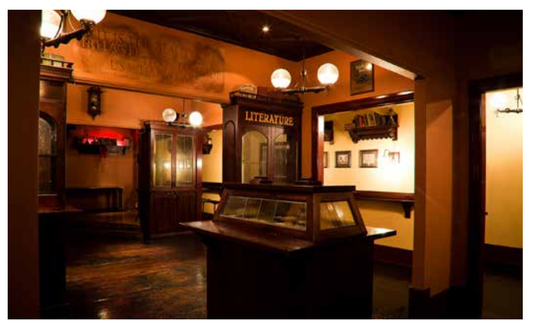
UPPER BALCONY BAR