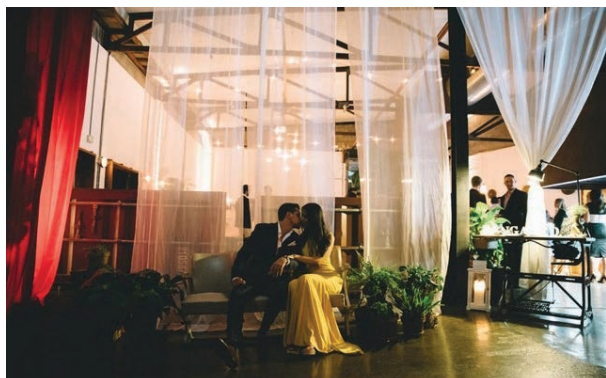
CELEBRATE IN STYLE