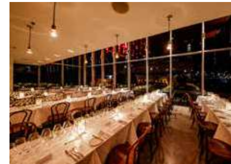
GOMA RESTAURANT DINING ROOM

GOMA Restaurant is open to the public Wednesday to Sunday for lunch from 12pm and Friday and Saturday evenings for dinner from 5.30pm. We offer group booking reservations Wednesday to Sunday, for groups of 11 to 65 guests.