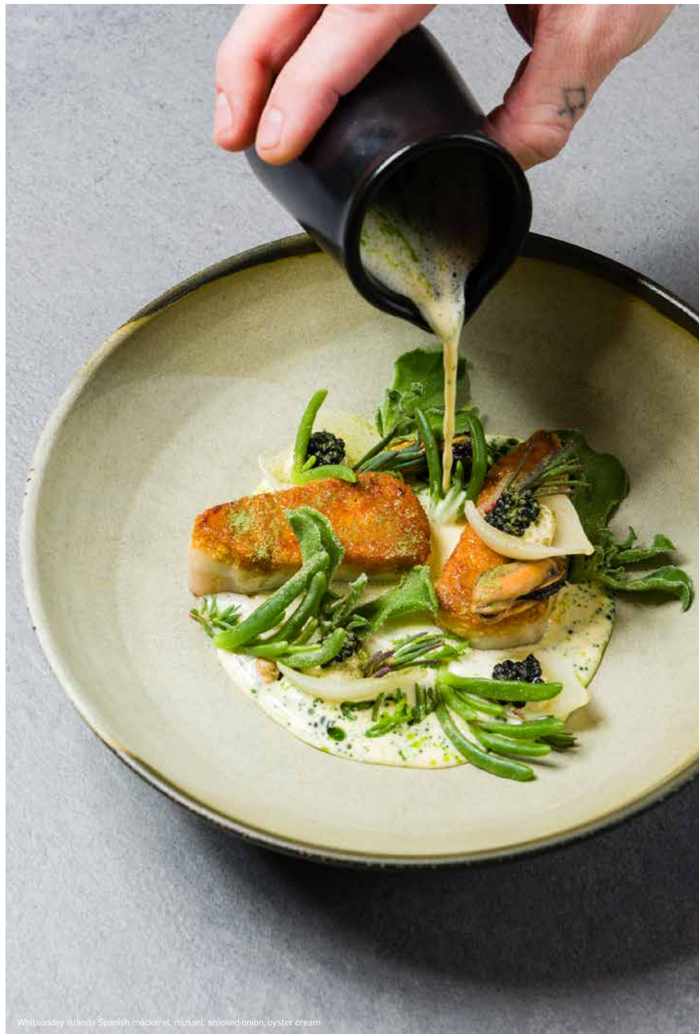
Whitsunday Islands Spanish mackerel, mussel, smoked onion, oyster cream