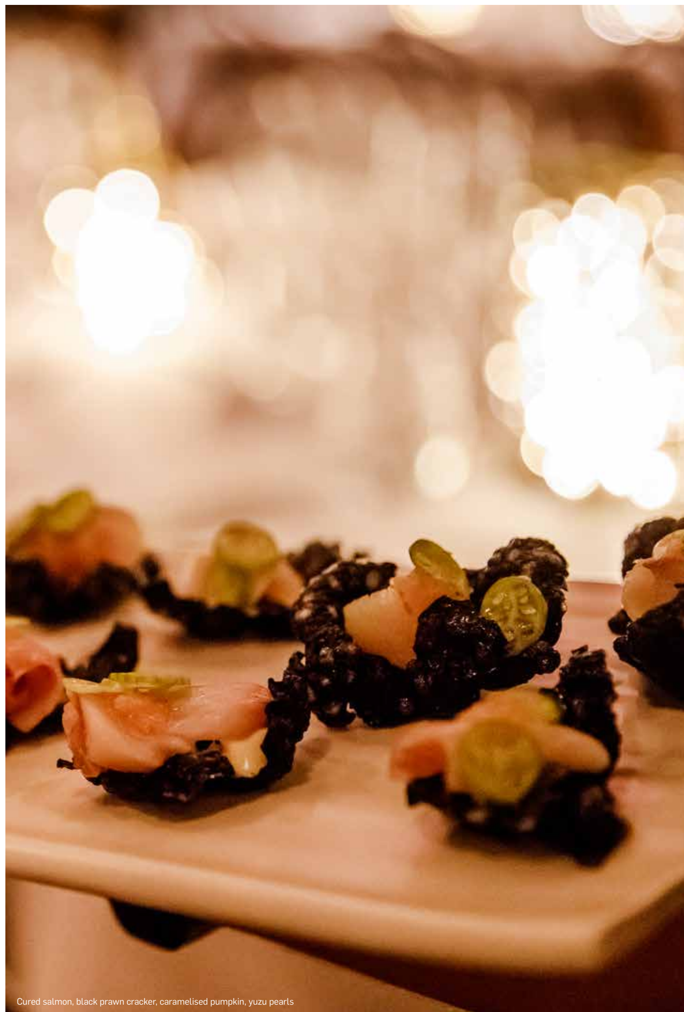
Cured salmon, black prawn cracker, caramelised pumpkin, yuzu pearls