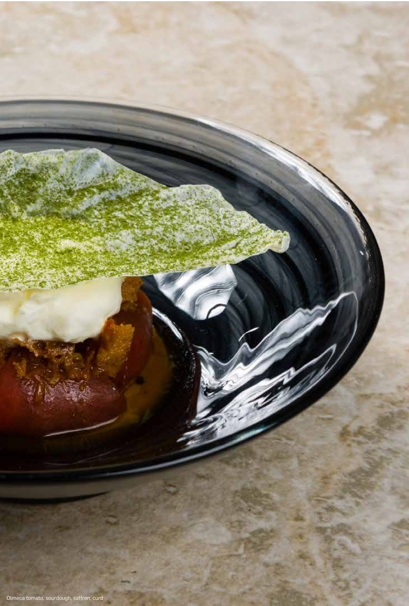
Olmecca tomato, sourdough, saffron, curd