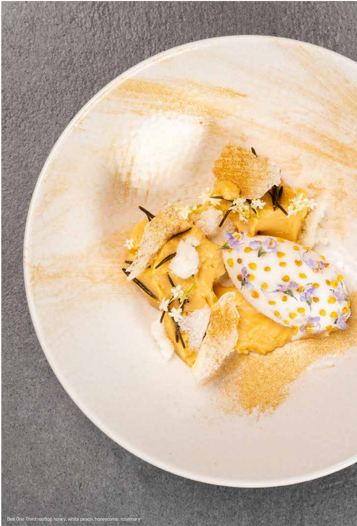
Bee One Third rooftop honey, white peach, honeycomb, rosemary