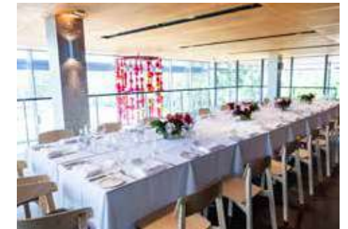
SEMI-PRIVATE DINING, MEZZANINE LEVEL