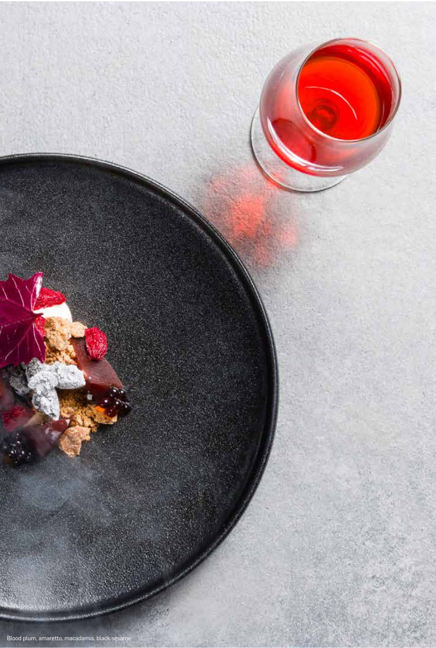
Blood plum, amaretto, macadamia, black sesame