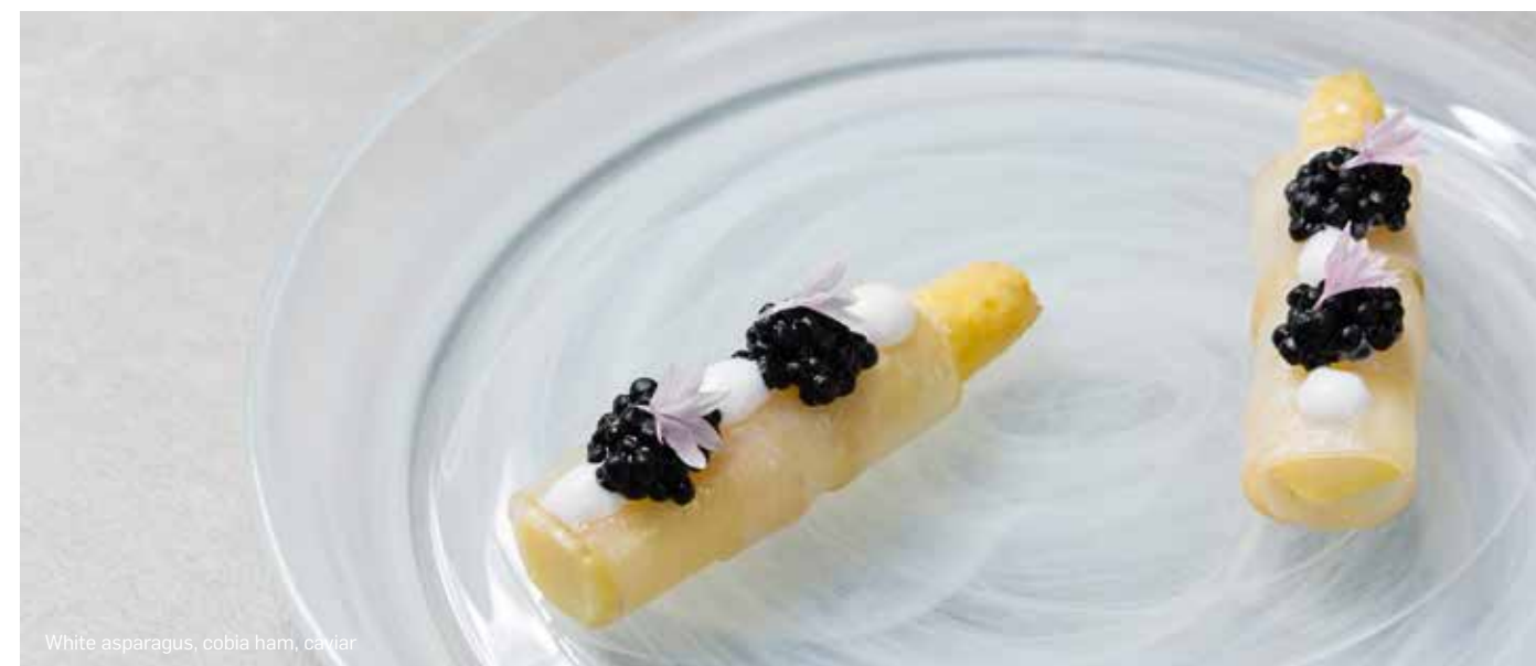
White asparagus, cobia ham, caviar

If you would like to hold a cocktail celebration for a longer duration or a large group, please contact us for a tailored package.