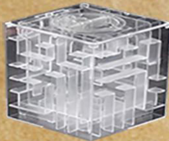
Money Maze Box $5