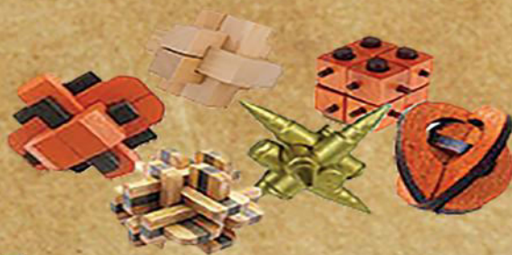
Crazy Puzzles $10