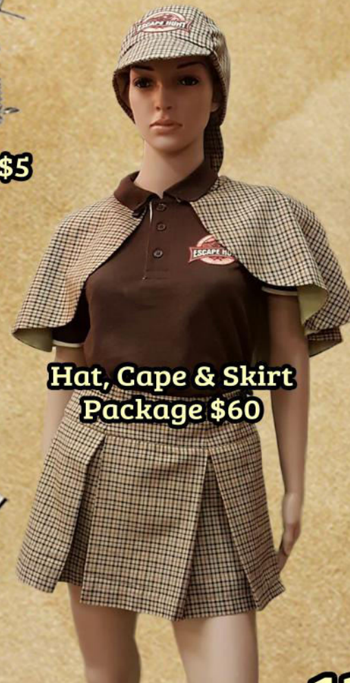
Hat, Cape & Skirt Package $60