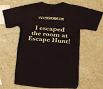
T-Shirts $20 (cream or brown)