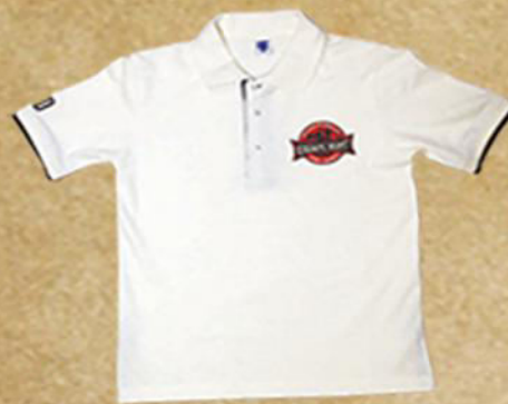
Polo Shirt $35 (cream or brown)