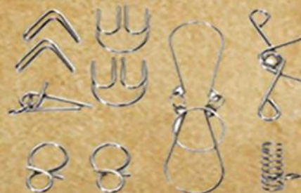
Metal Brain Teasers $5