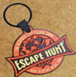
Key Chain $5

We can tailor a merchandise package to suit your needs, either for the winning team or for all participants.