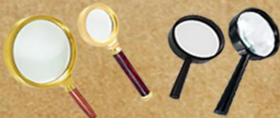
Magnifying Glass Black - Small $4 Large $7 Gold - Small $5 Large $9