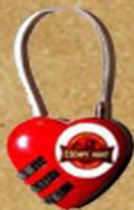
Heart Lock $7